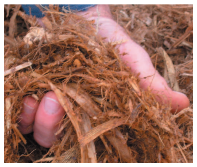
Ensiled Corn Stalks and Distillers Solubles

Profit in the beef cow enterprise is driven by product output value and cost of that production. The ISU Beef