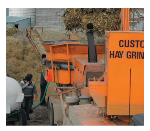
Combining Corn Stalks and Distillers Solubles while Tub Grinding

When corn gluten feed or distillers dried grain were compared by Illinois researchers as supplements to ground alfalfa hay for lactating Simmental cows, distillers dried grain fed cows gained more weight per day, but corn gluten feed fed cows produced more milk (Shike et al. 2004). Calf weights and rebreeding performance were similar.