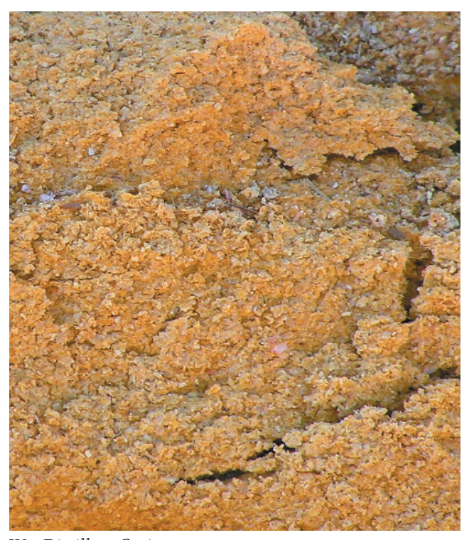
Wet Distillers Grains

of corn co-products from dry-mill ethanol plants. For instance, in distillers dried grain with solubles they found the crude protein content to have a standard deviation of 2.78 percent from the average of 33.3 percent. Fiber, fat and mineral content was also variable. So it is important to contact a supplier for detailed analyses.